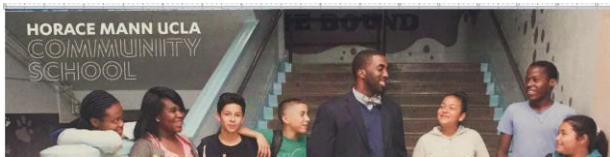
The picture above represents Horace Mann UCLA Community School and includes two students with special needs.

Mann Middle School's relationship with UCLA provides all of their students, including those with special needs, with access to one of the richest educational resources in the nation. The Horace Mann UCLA Community School engages UCLA students, staff, and faculty from across campus units to create meaningful learning opportunities for their students, families, and educators.