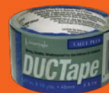
Duct Tape - 1-7/8" x 10 yds. Product ID: 8322490110 $1.99 / each (roll)