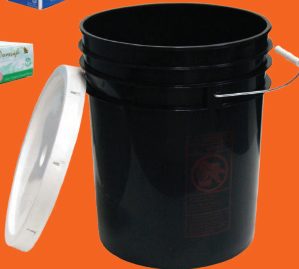
Utility Bucket/Pail - 5 Gallons Product ID: 3453248353 $4.86 / each