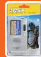
Pocket Radio Product ID: 7250070002 $4.42 / each