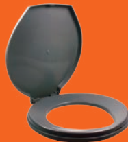
Emergency Toilet Seat Product ID: 3453248352 $8.95 / each