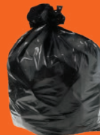
Polyethylene Bags Product ID: 6652452120 $14.99 / 500 (case)