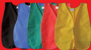
Incident Command Vest Set Product ID: 3459200388 $112.99 / 10 vests