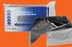
Emergency Blanket Product ID: 3453025575 $1.19 / each