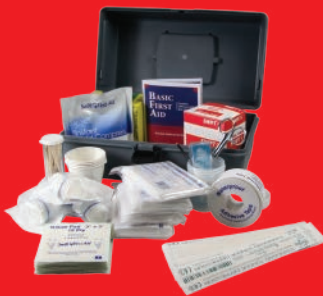
First Aid Kit Product ID: 3453248300 $40.35 / each