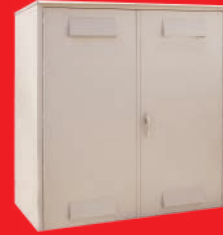
Outdoor Storage Box 72"W x 77.25"H x 38"D Product ID: 1002171500 $1,465.00 / each