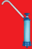
Water Pump Product ID: 7200620055 $15.84 / each