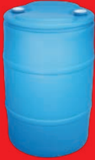
Water Barrel - 55 Gallons Product ID: 1004570546 $52.99 / each