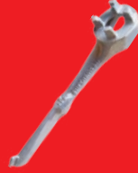
Wrench for Water Barrel Product ID: 445-91-99999 $16.68 / each