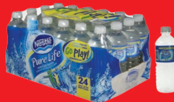
Bottled Water Product ID: 3909107099 $5.43 / 24 bottles (case)