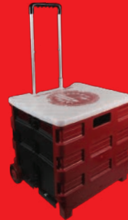
Emergency Supply Cart Product ID: 5606900105 $21.99 / each