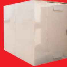
Outdoor Storage Box 60"W x 73.5"H x 96"D Product ID: 1002150100 $2,375.00 / each