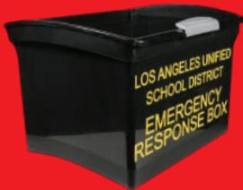
Emergency Response Box Product ID: 3453248385 $18.53 / each