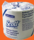
Toilet Paper Product ID: 6407556175 $51.99 / 80 rolls (case)