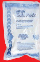
Cold Pack Product ID: 4750954200 $0.75 / each