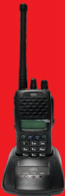
Two-Way Radio (Walkie-Talkie) Product ID: 7257800185 $299.99 / each