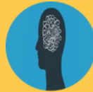
Inner Explorer Mindfulness