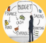
EVERFI Mental Wellness Financial Literacy