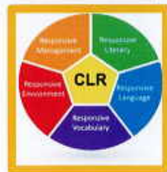
Instructional Strategies to Support Culturally and Linguistically Responsive Instruction