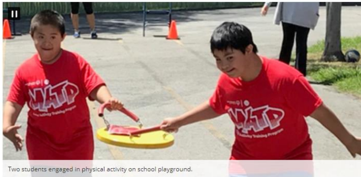
Two students engaged in physical activity on school playground.